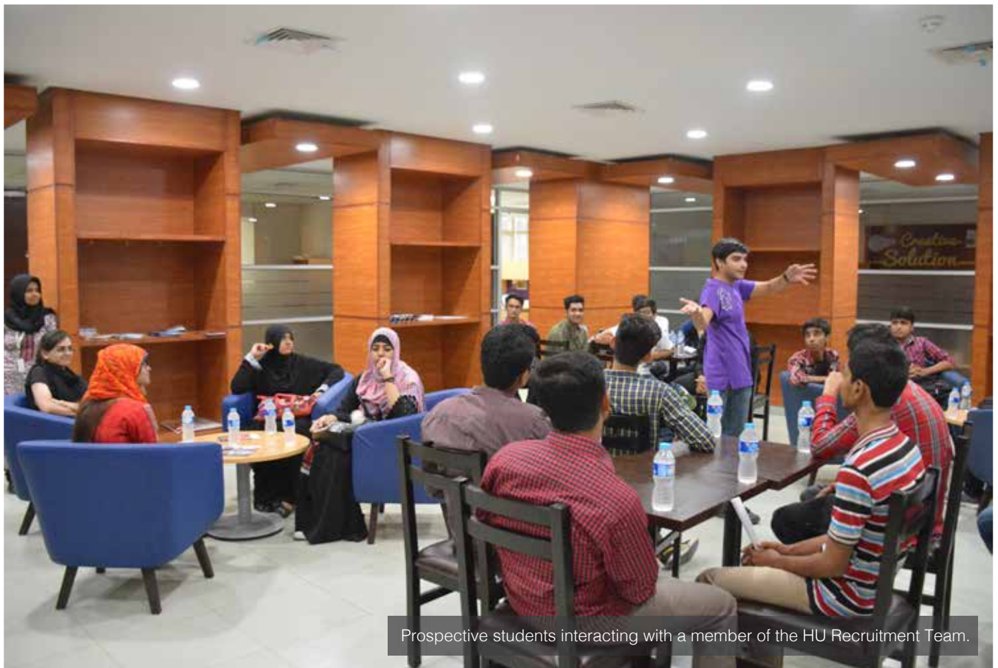
Prospective students interacting with a member of the HU Recruitment Team.