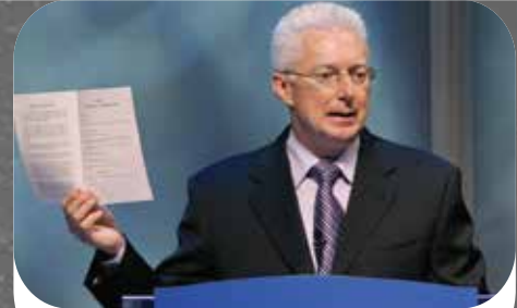
Alan Lafley, CEO P&G