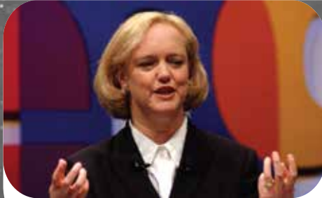
Meg Whitman, CEO Ebay