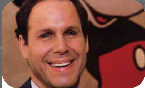
Michael Eisner, CEO Disney

Senior executive hiring trends show the value of liberal arts training. A large number of successful CEOs and other senior executives have come from a liberal arts background rather than a traditional business school.